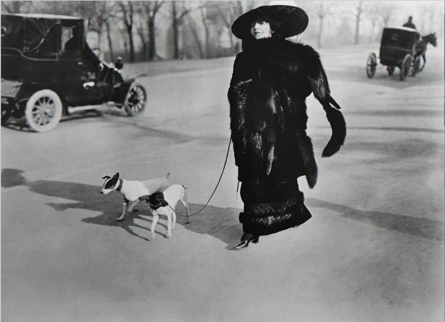
Jacques-Henri Lartigue, Avenue du Bois de Boulogne, Paris, 1911