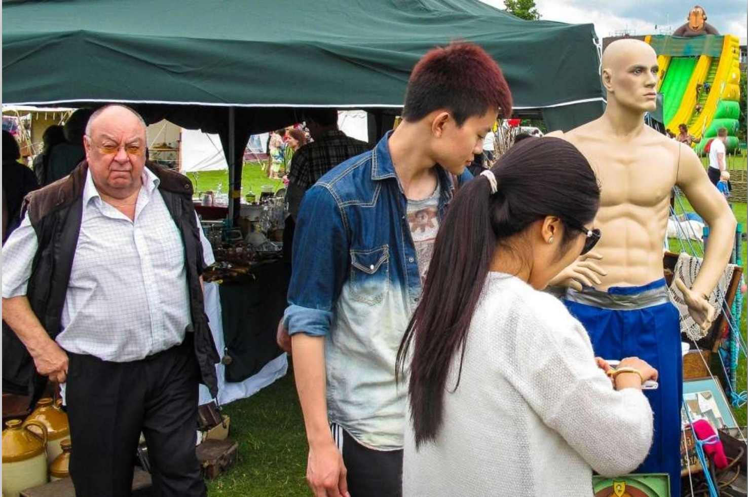
Parker's Piece, Cambridge, 2012