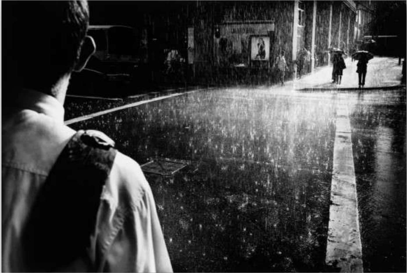
Trent Parke, Sydney, Australia , 1998