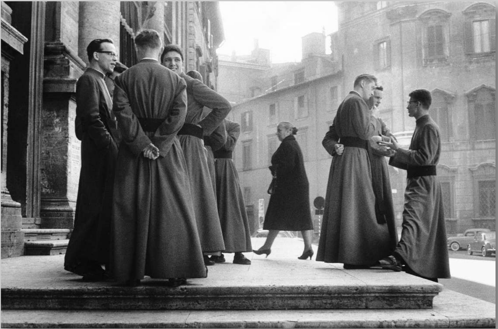
Henri Cartier-Bresson, Rome, Italy, 1959