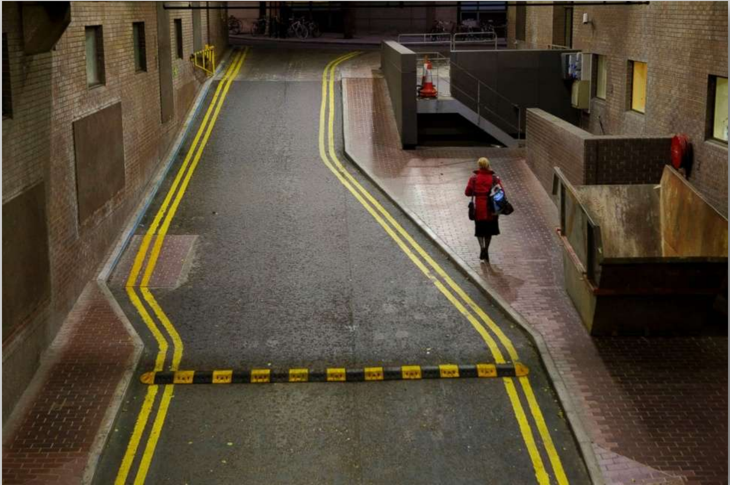
Harry Gruyaert, London , 2012