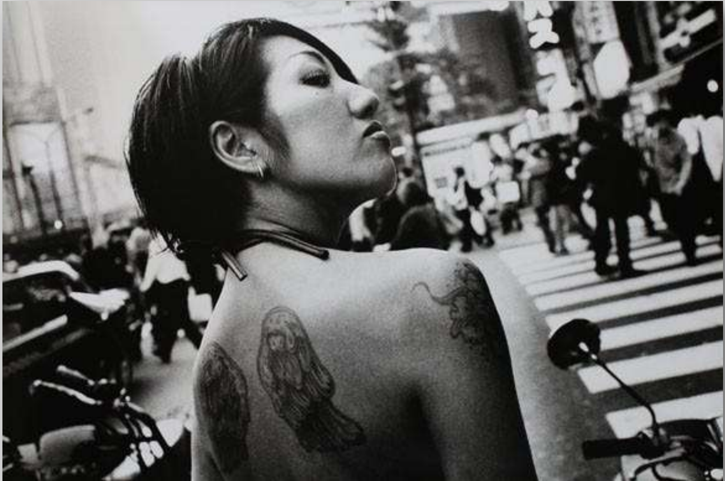
Daido Moriyama, Shinjuku , 2002