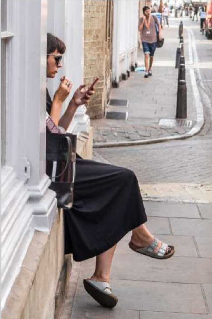
Trinity Street, Cambridge, 2018