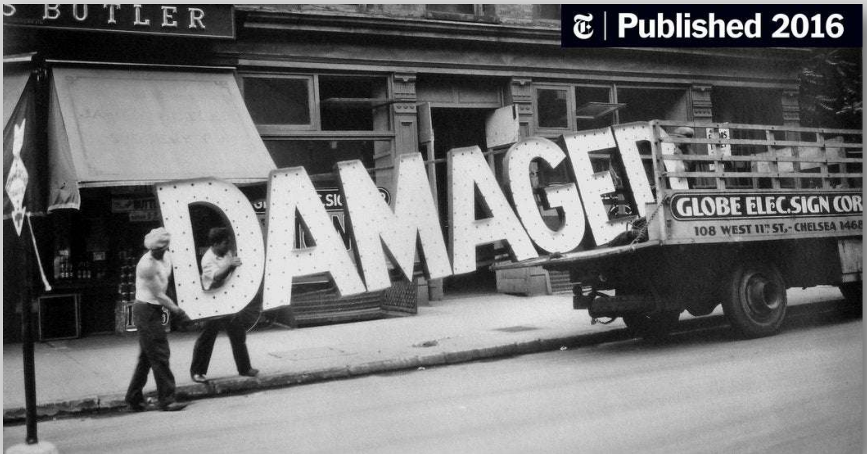
Walker Evans, Damaged , 1928-30