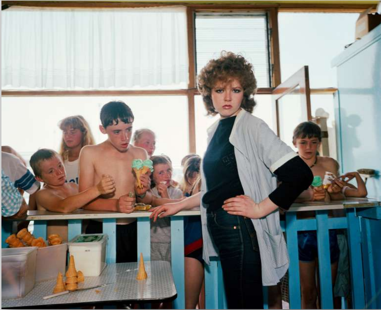
Martin Parr, New Brighton , 1983-85