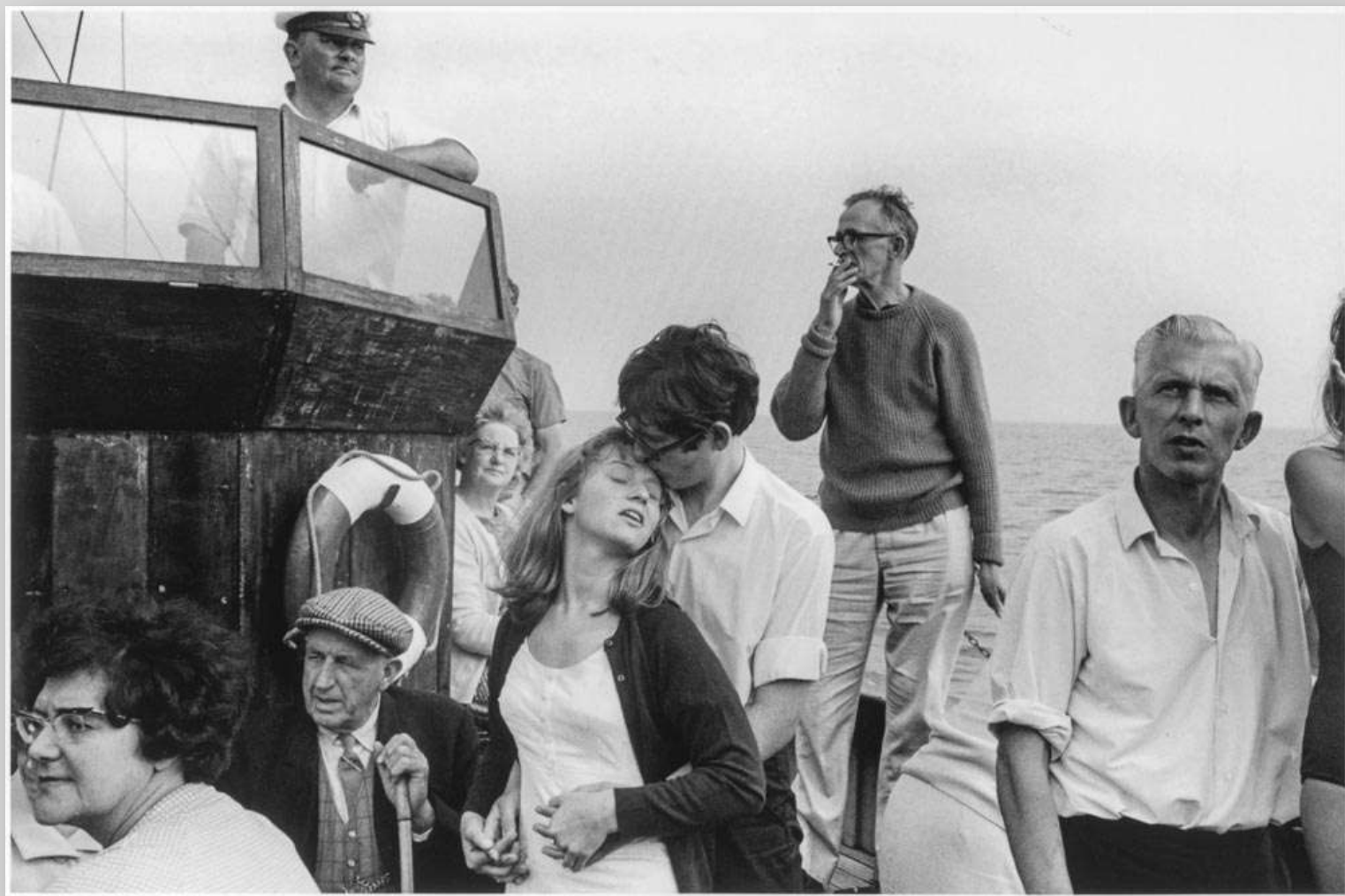
Tony Ray-Jones, Beachy Head, Tripper Boat , 1967