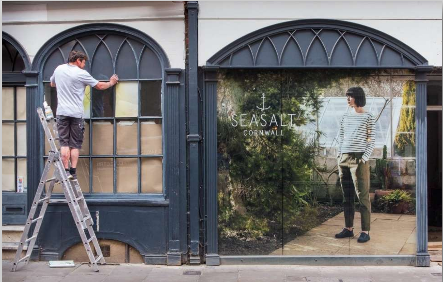
Trinity Street, Cambridge, 2018