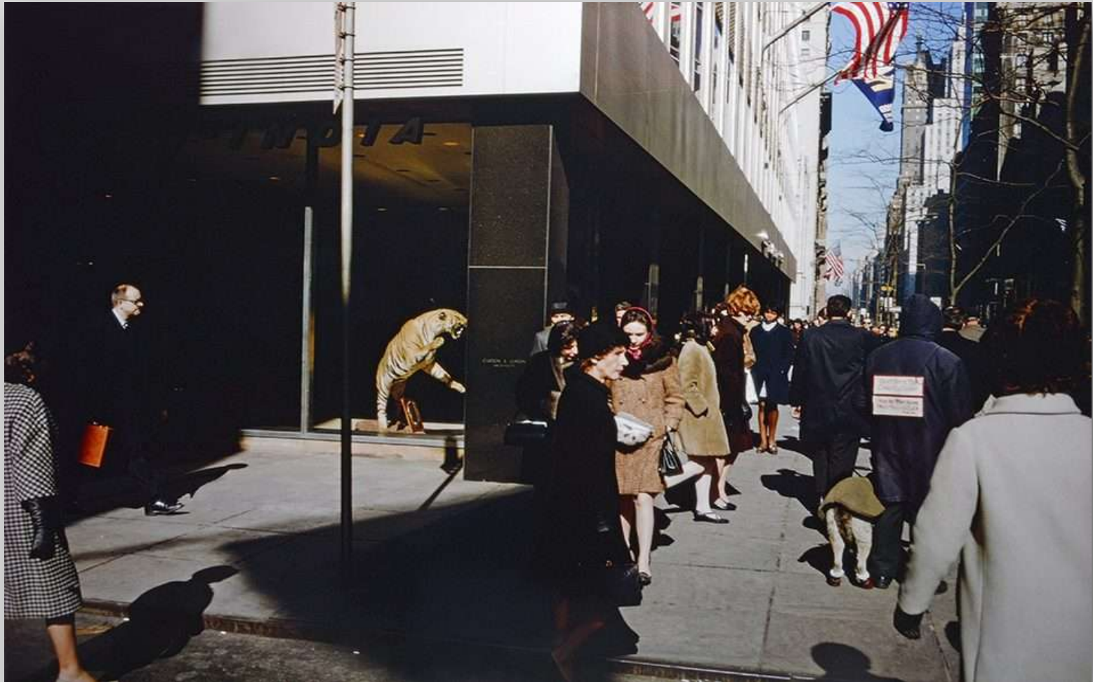
Joel Meyerowitz, New York City , 1975