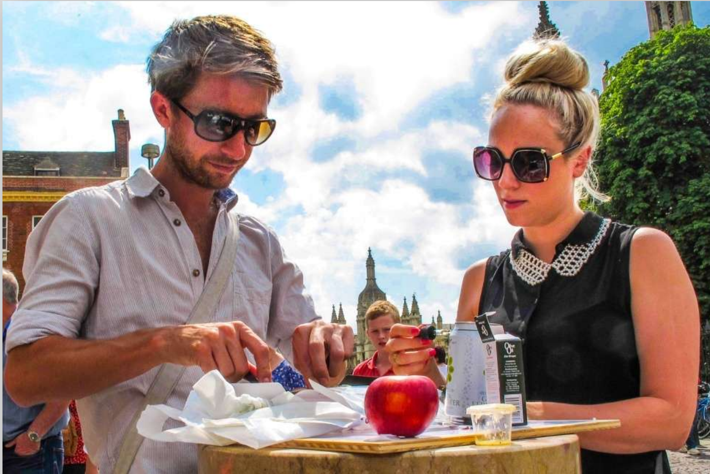
Senate House Hill, Cambridge, 2012