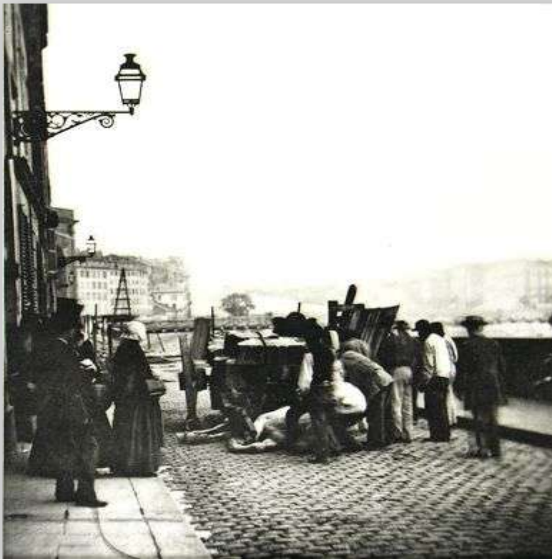
Charles Negre, Fallen Horse , Quai de Bourbon, Paris, c. 1855