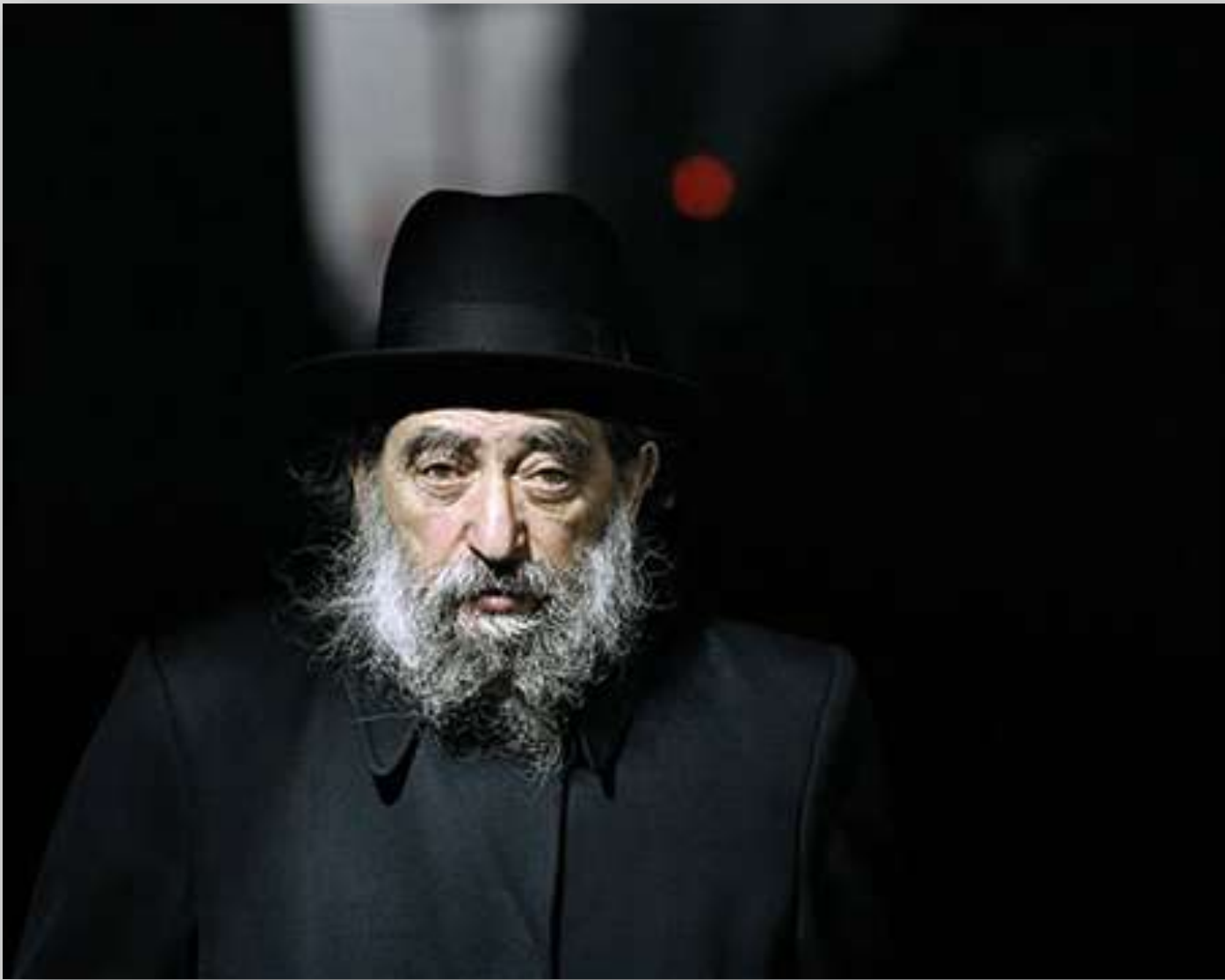
Philip-Lorca diCorcia, Head #13 , 2001