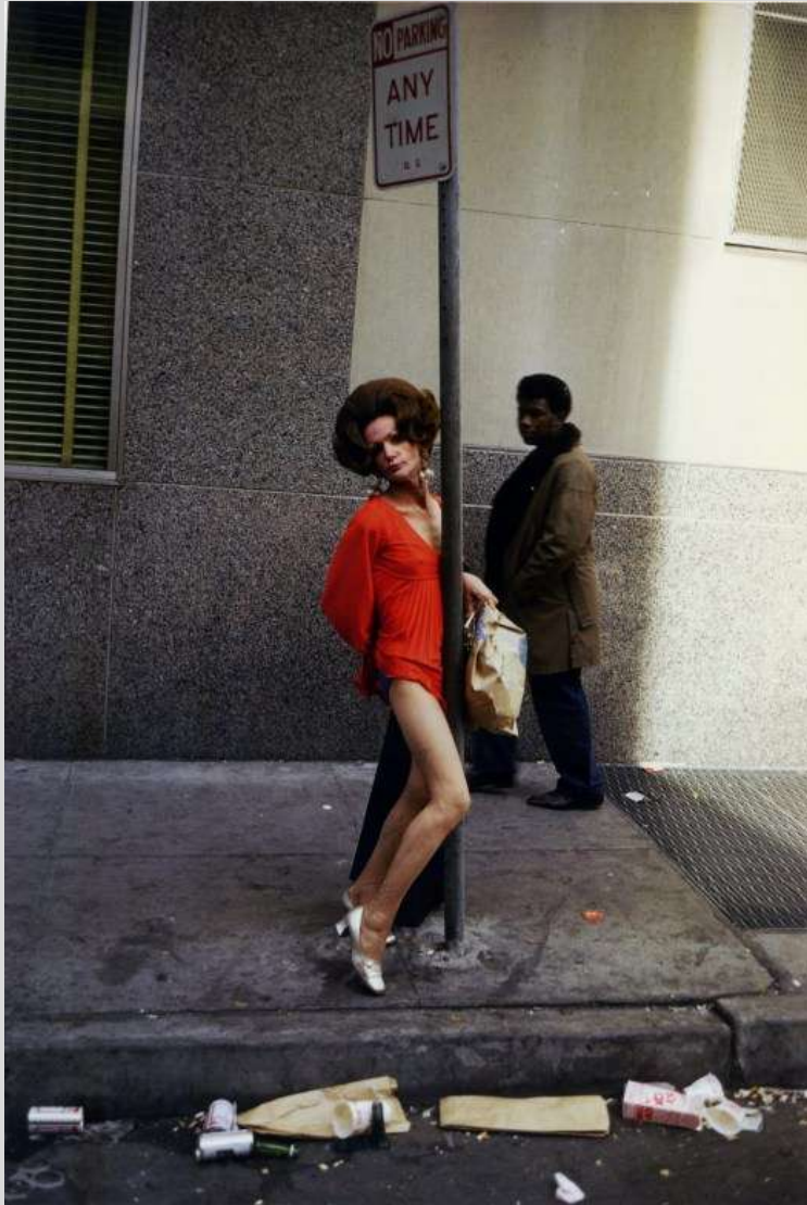
William Eggleston, Untitled ( Chromes , 1969 – 1974)