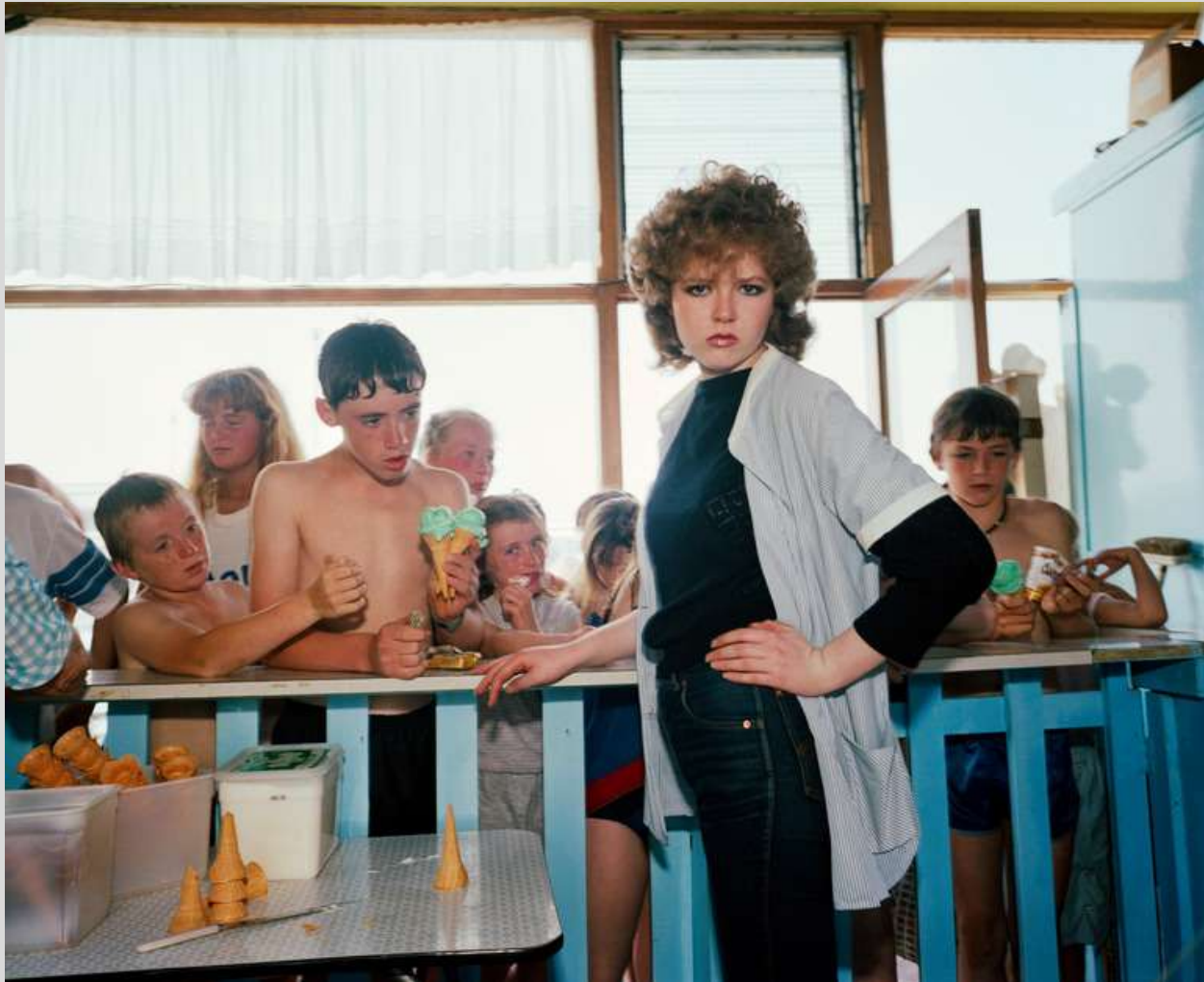
Martin Parr, New Brighton , 1983-85