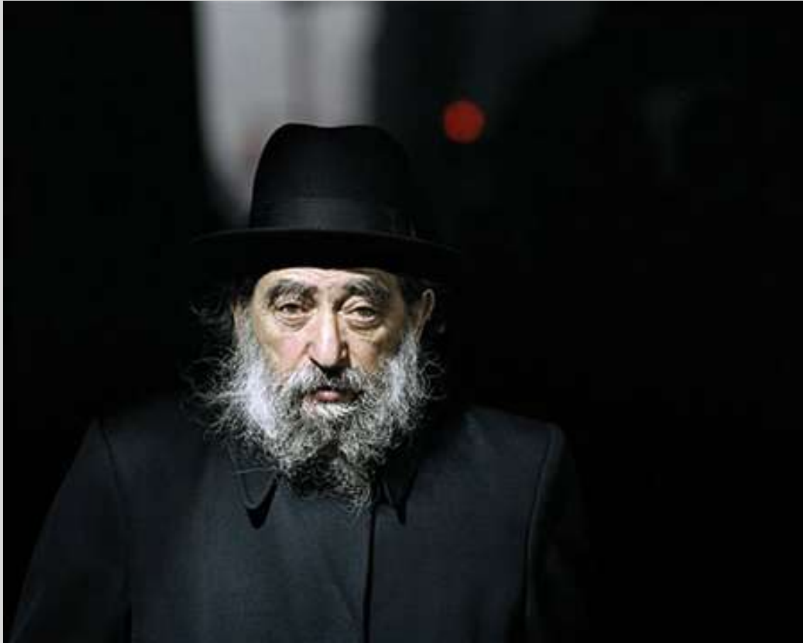
Philip-Lorca Dicorcia, Head #13, 2001