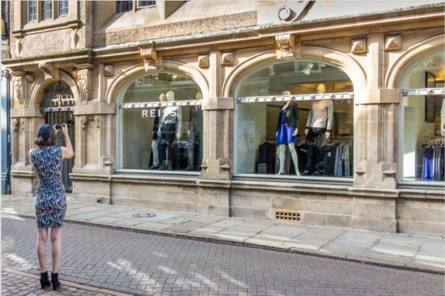
Trinity Street, Cambridge, 2014