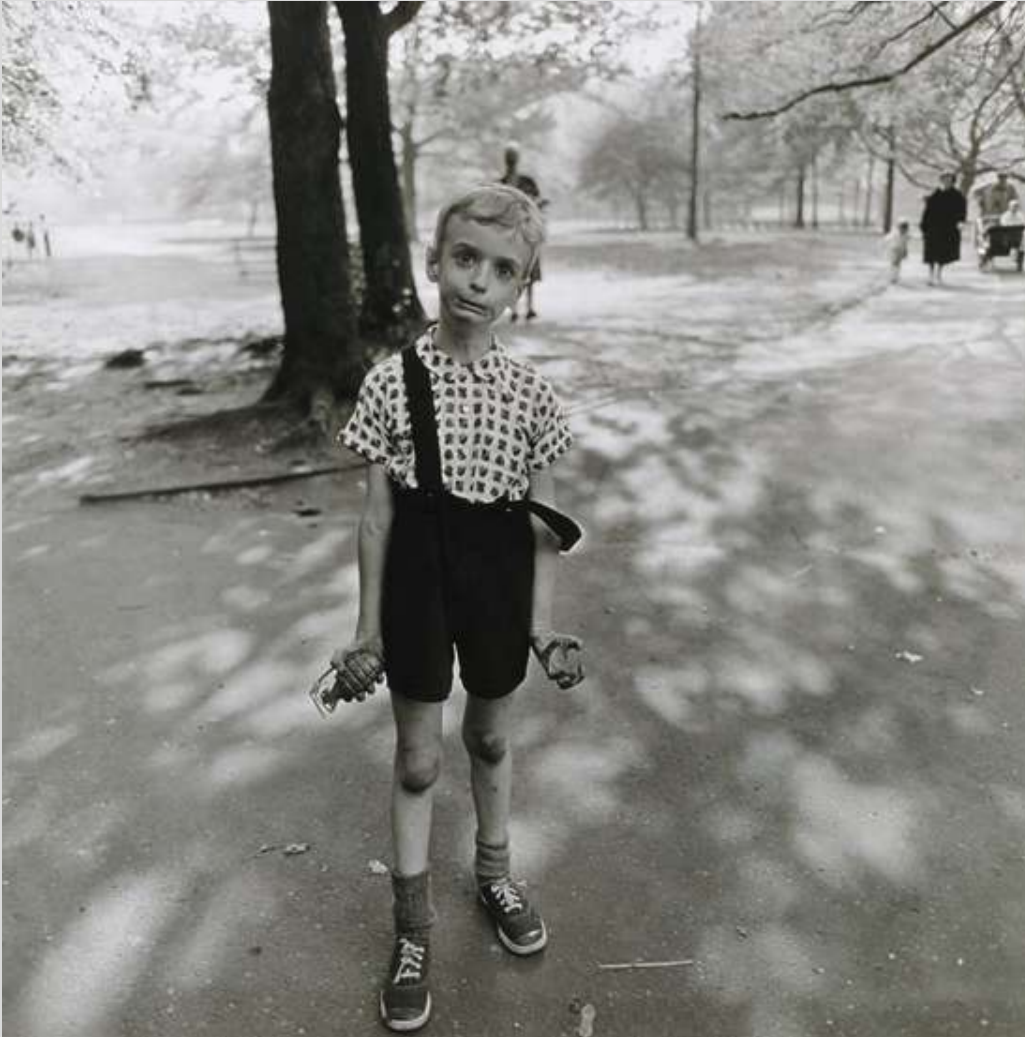
Diane Arbus, Child with a toy hand grenade in Central Park, N. Y. C., 1962