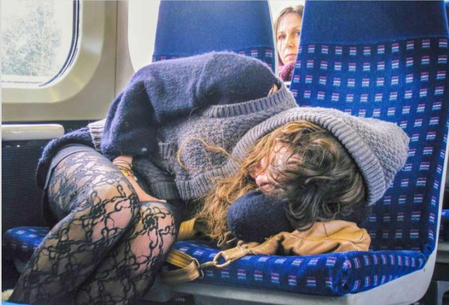
TGV Lille-London, France, March 2011