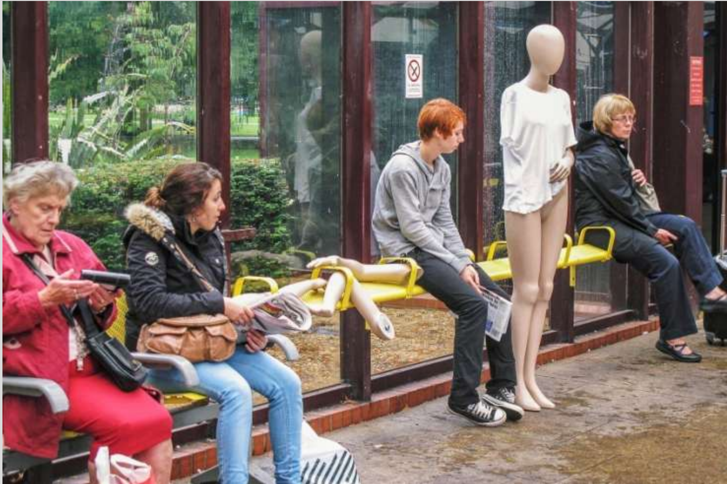
Drummer Street, Cambridge, 2010