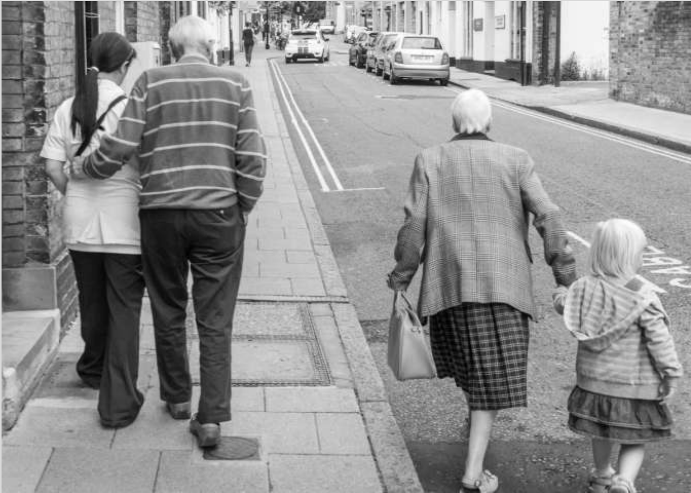
Guildhall Street, Bury St Edmunds, Suffolk, 2011