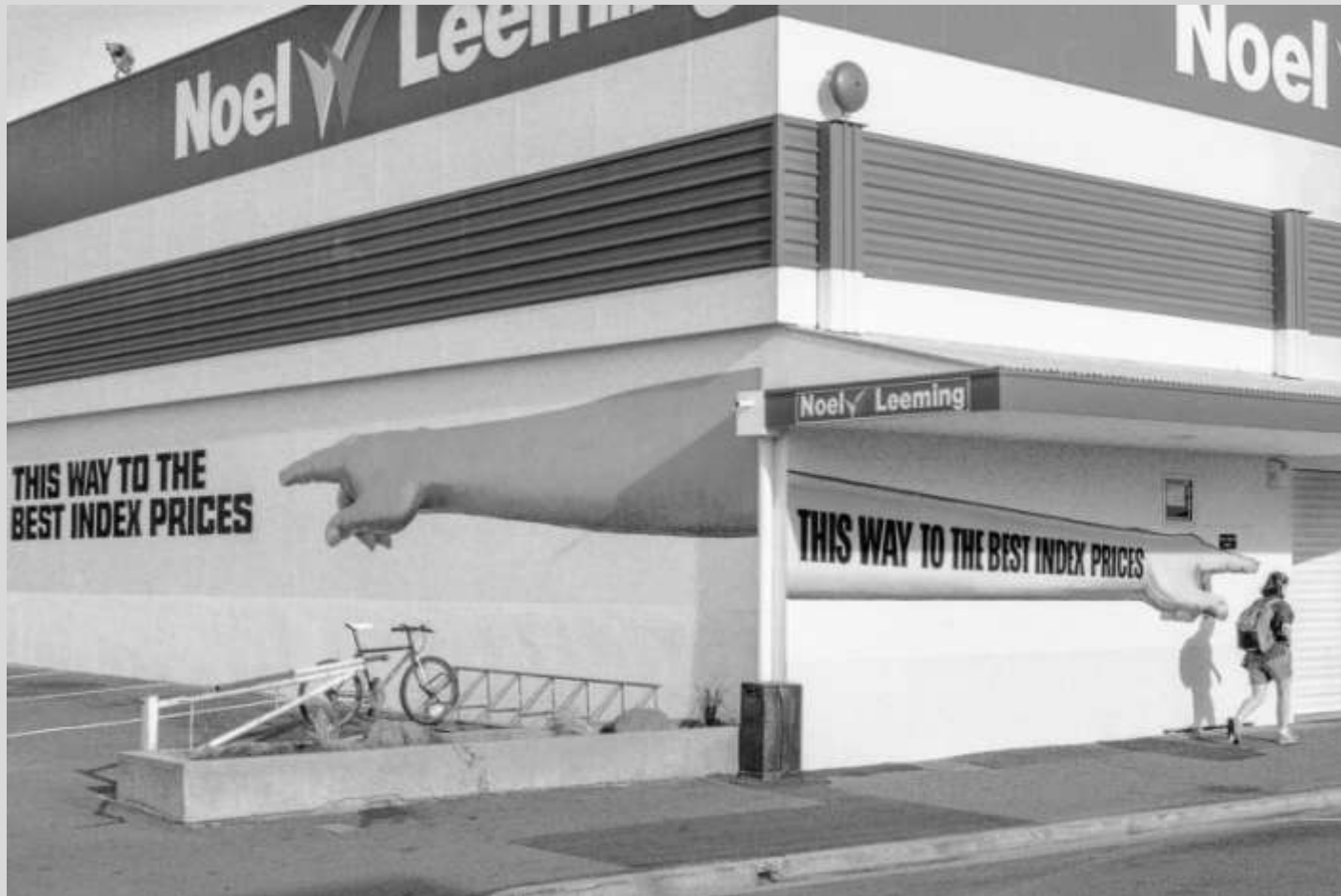
Christchurch, New Zealand, 1996