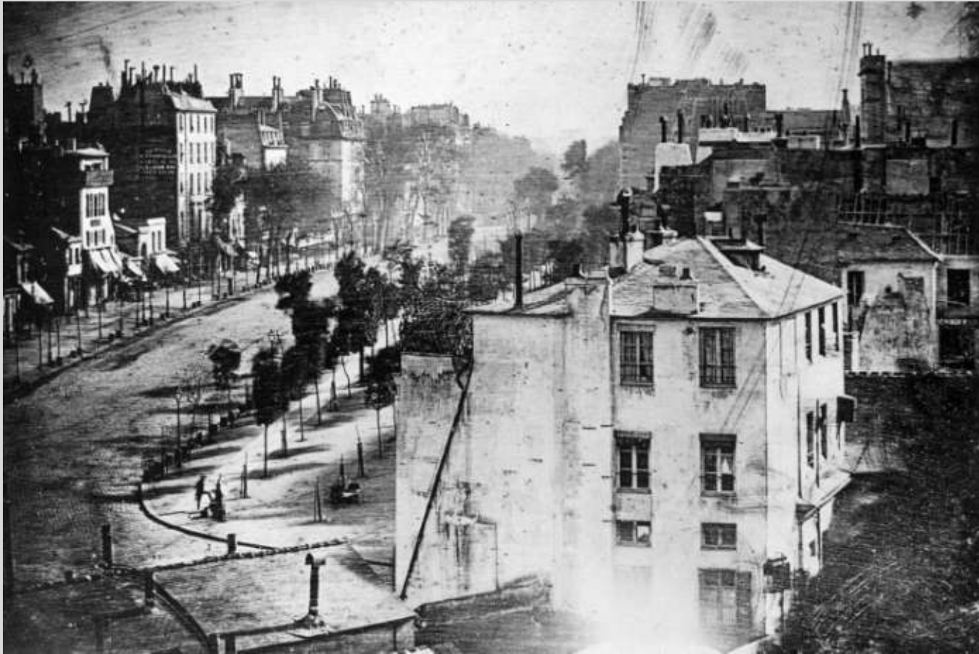
Louis Daguerre, Boulevard du Temple , 1838