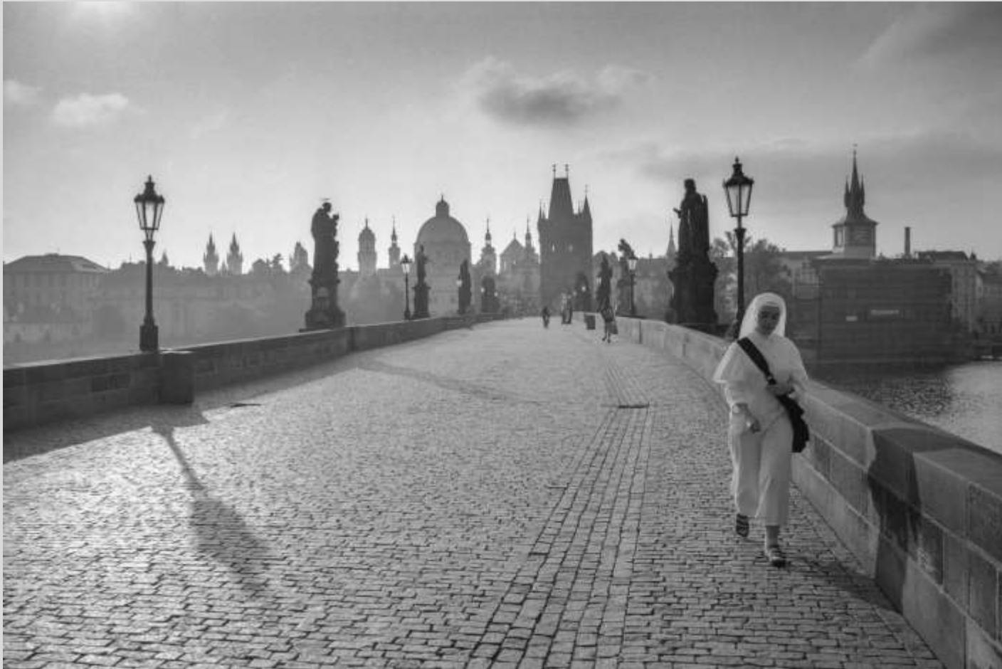
Charles Bridge, Prague, Czech Republic, 2004