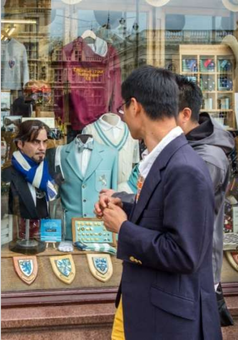
Great St Mary's Passage, Cambridge, 2016