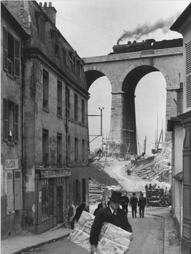
Andre Kertesz, Meudon, France, 1928