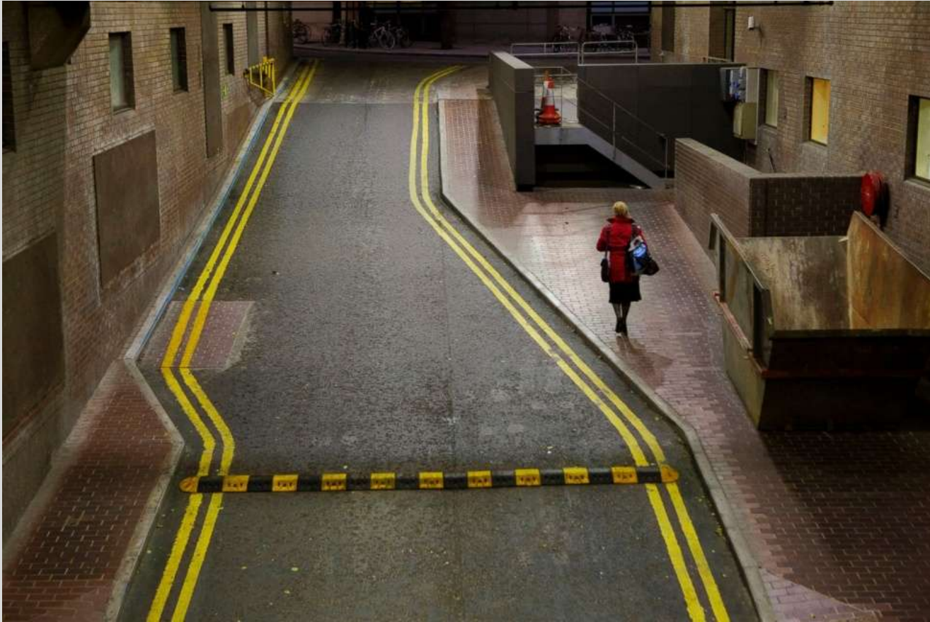
Harry Gruyaert, London , 2012

‘...epiphanies of color and contours...’