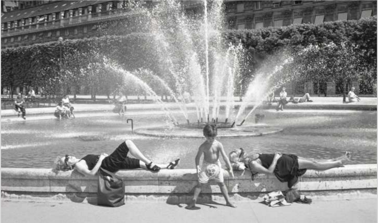
Jardin du Palais Royal, Paris, 1990