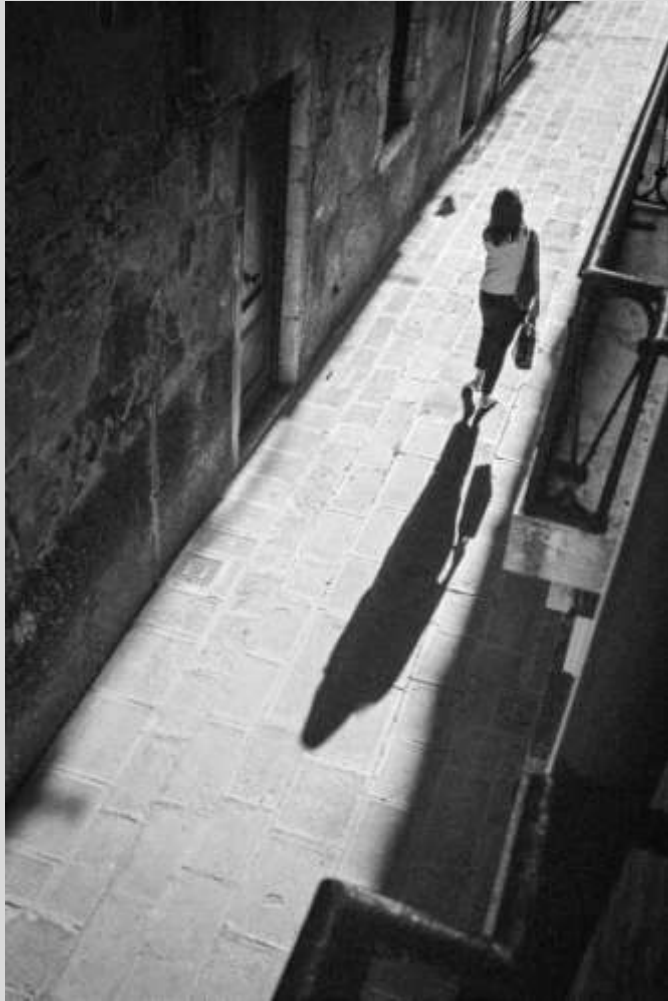
Calle del Forno, Venice, Italy, 2008