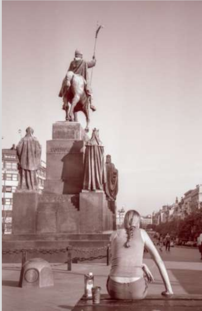
Wenceslas Square, Prague, Czech Republic, 2004