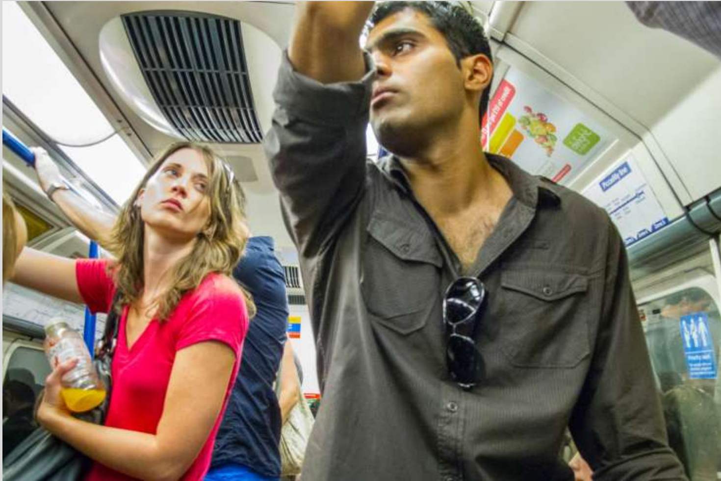
London Underground, Piccadilly Line, 2011