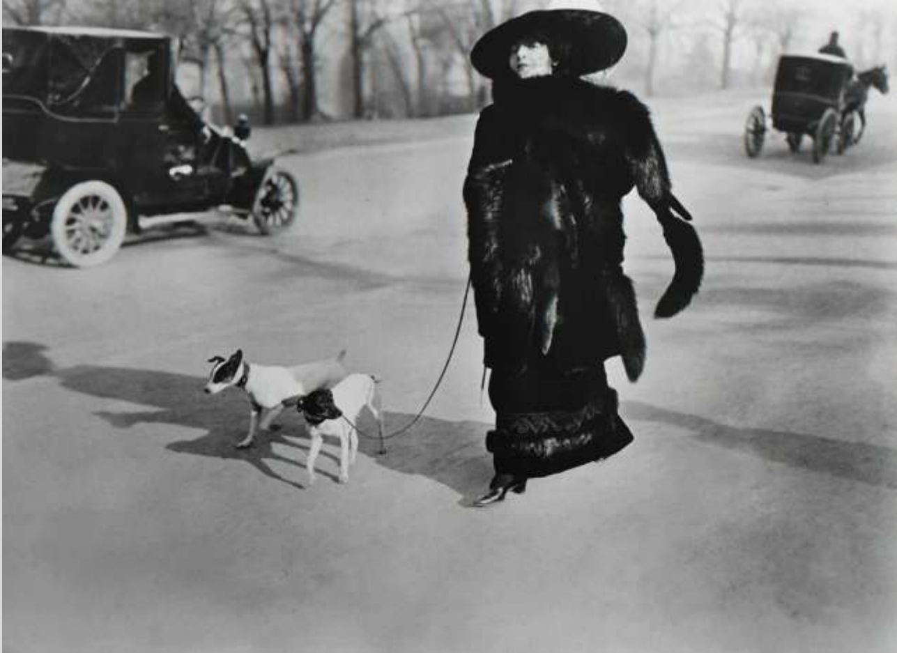
Jacques-Henri Lartigue, Avenue du Bois de Boulogne, Paris, 1911