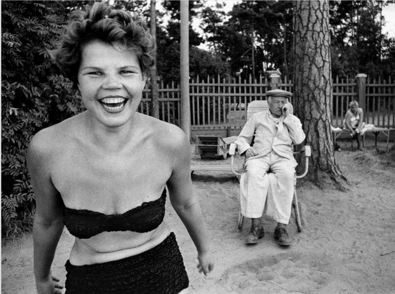
William Klein, Bikini, Moscow, 1959