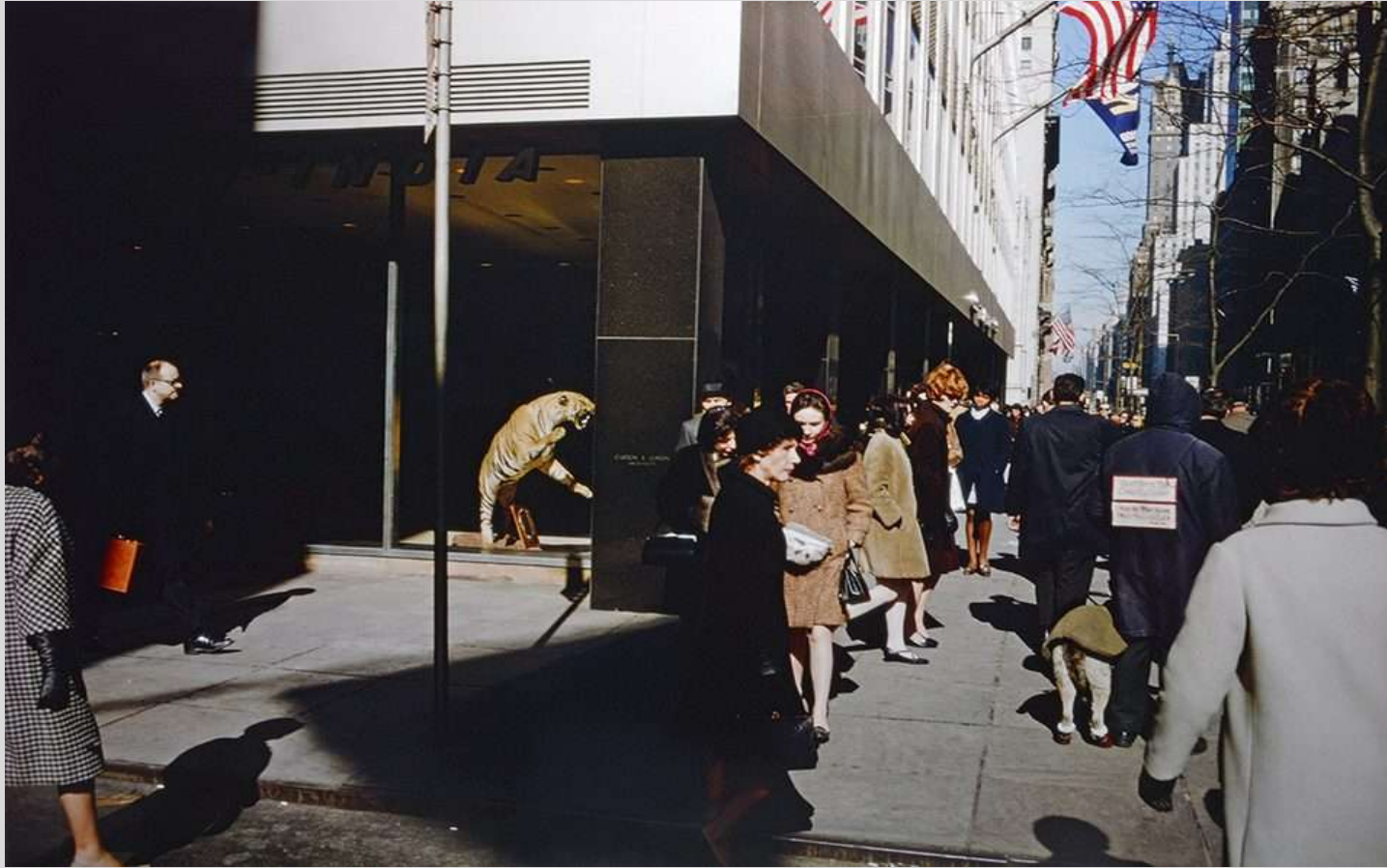
Joel Meyerowitz, New York City , 1975