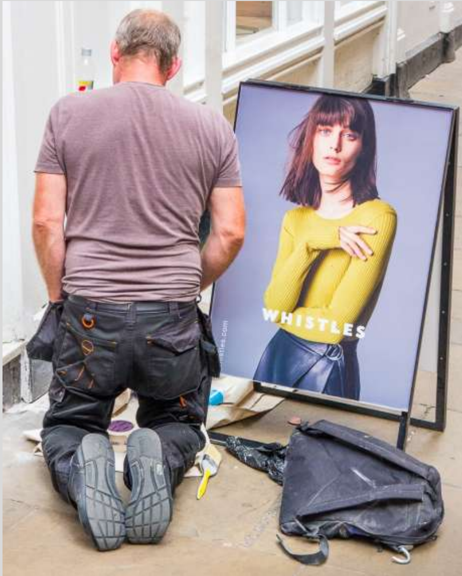
Rose Crescent, Cambridge, 2015