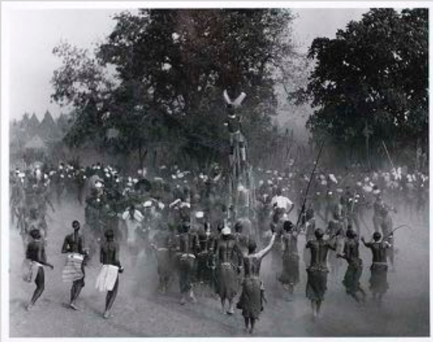
13. George Rodger, Latuka Tribe Rain Making Ceremony, Sudan, 1938