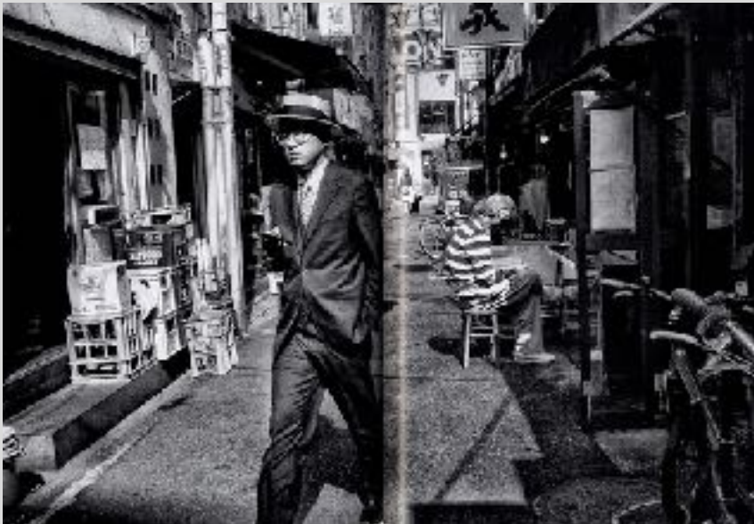
17. Daido Moriyama, Bye Bye Photography , 1972