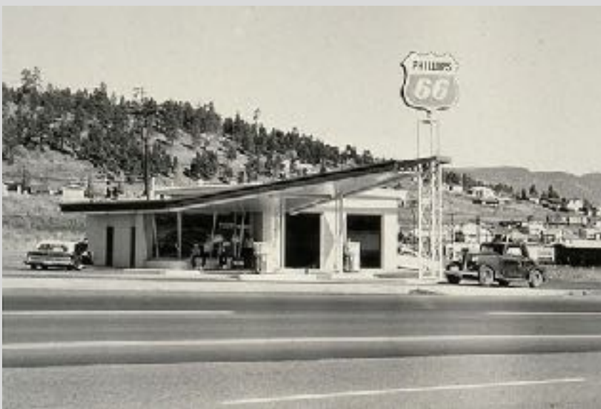
15. Ed Ruscha, from Twenty Six Gasoline Stations , 1962