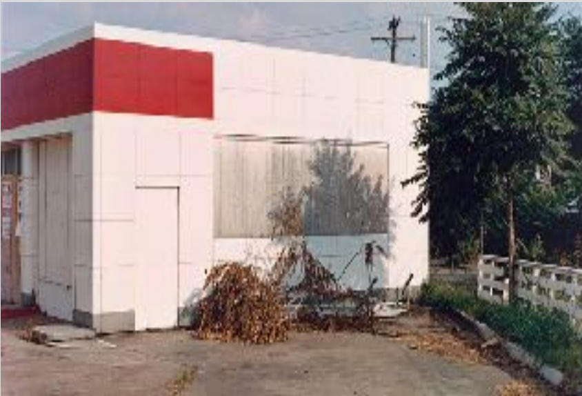
18. William Eggleston, Tallahatchie County, Mississippi, c. 1972