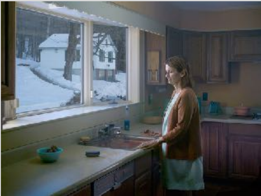
20. Gregory Crewdson, Woman at Sink , 2014