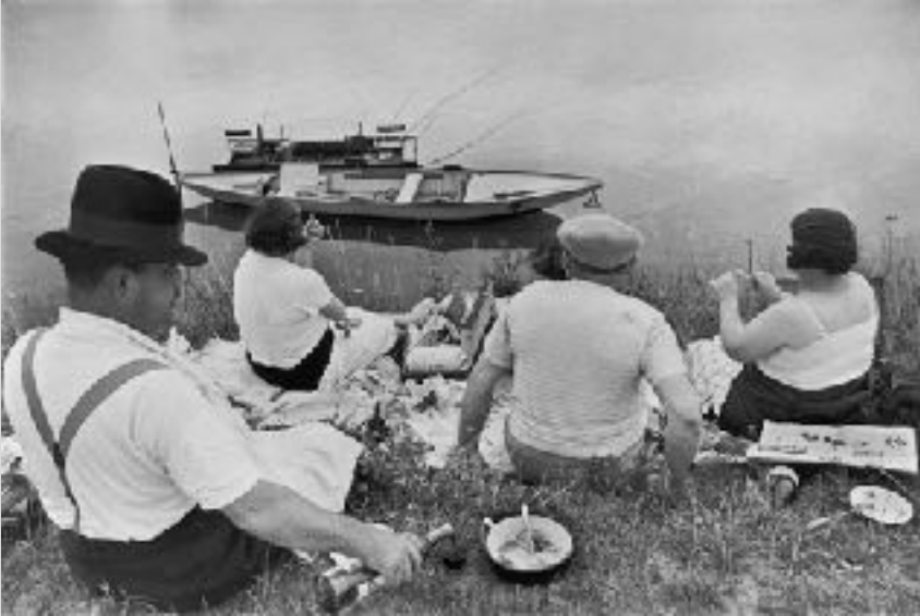
14. Henri Cartier-Bresson, Picnic on the Marne , 1938