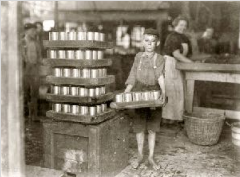
8. Lewis W Hine, child labour, 1909