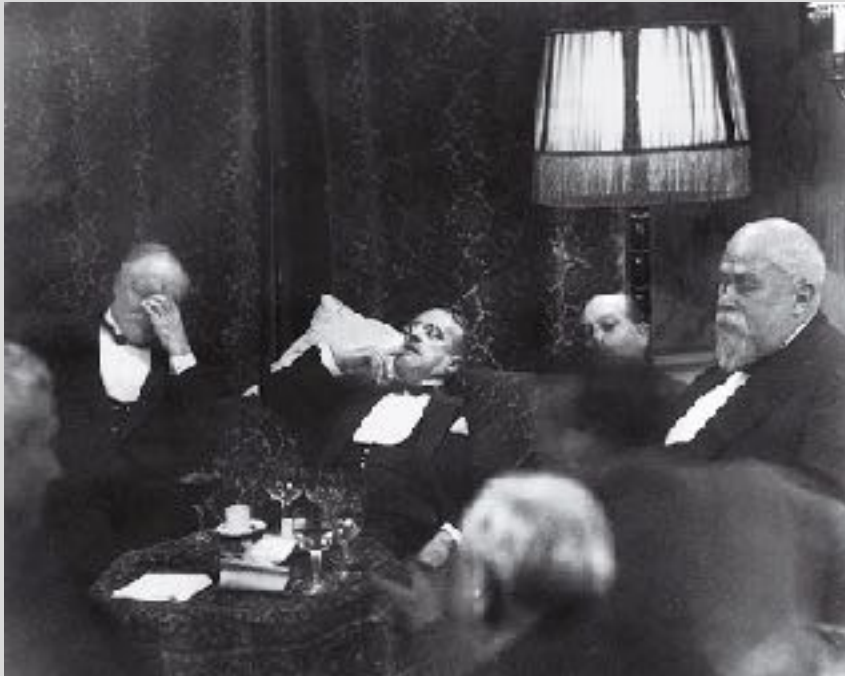
11. Erich Salomon, Hague Reparation Conference, 1930