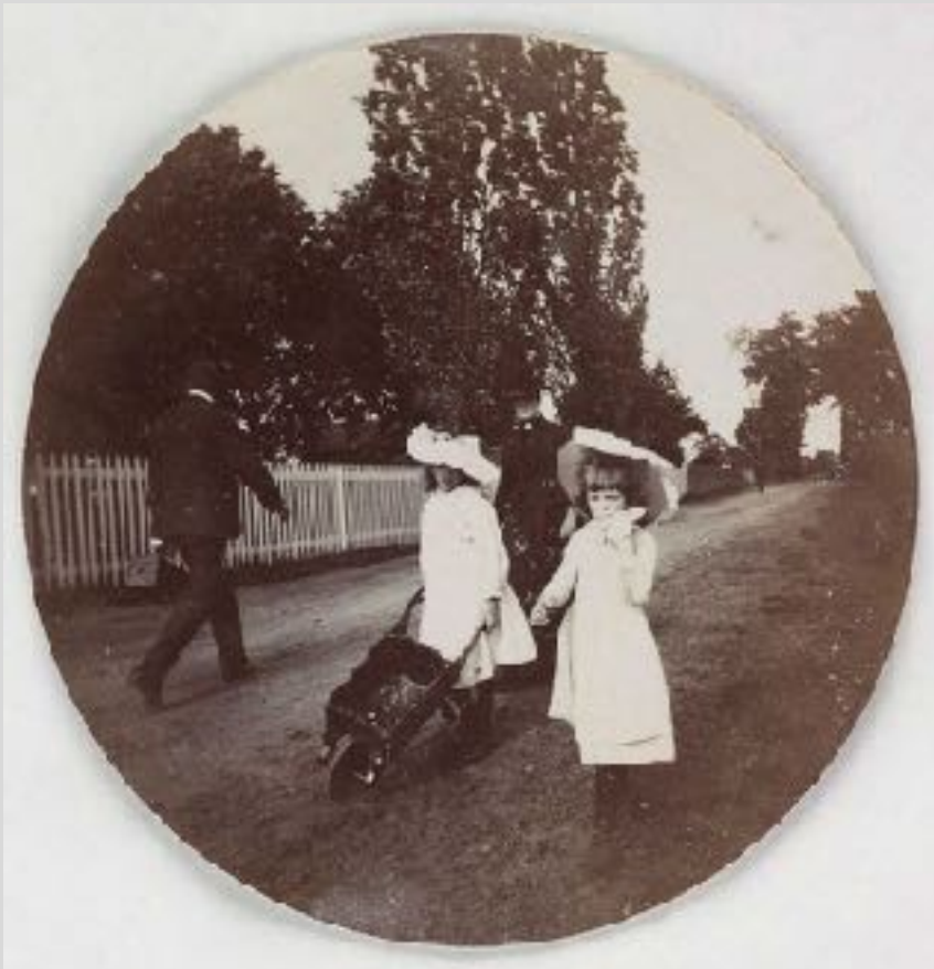
6. Photo No 1 Kodak camera, introduced 1888