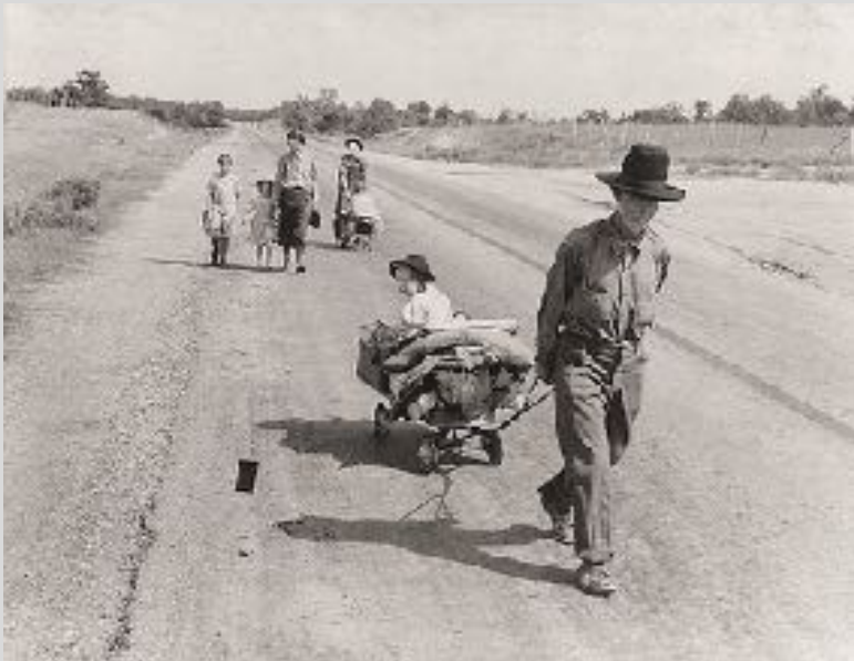
12. Dorothea Lange, On the Road , 1936