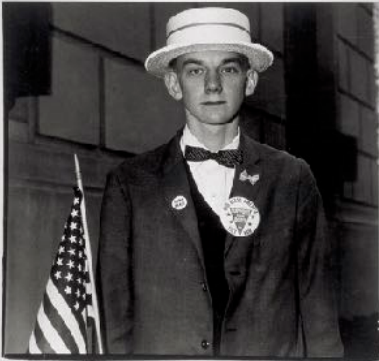
16. Diane Arbus, A Boy with Straw Hat and Flag About to March in a Pro-War Parade, New York, 1967